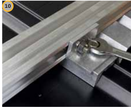
10 Install the mounting rail with brackets