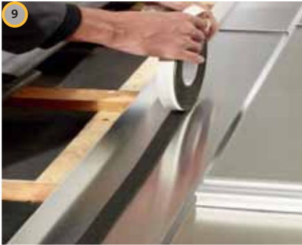
9 Place the sealing tape